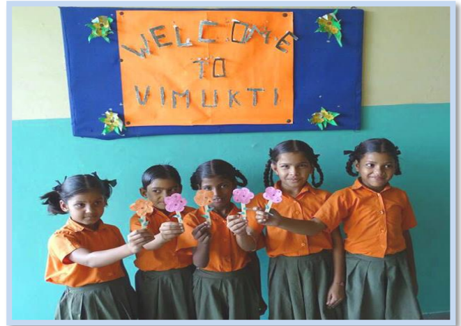
Vimukti girls happily showing off their popsicle flower.

And they all keep on dreaming and realizing it all when only a few years ago it seemed to be impossible. Congratulations to all of the actors who turn these dreams into reality. IASE has helped a bit over the years by being able to provide some school supplies, books, uniforms, and a local puppet show performance. So, all of you can share in their success! These well deserving students learn more than just the prescribed curriculum. They know that working together towards goals, by sharing and volunteering, dreams can become real!