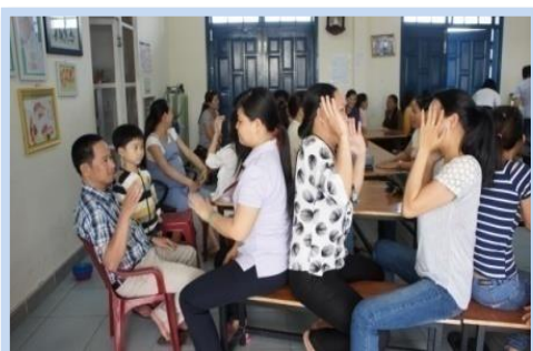
Parents and teachers modeling emotions.

The workshop was a success. Kianh staff were fantastic at supporting the parents. The parents demonstrated an increase in their active participation throughout this workshop presentation. It was amazing to watch as their confidence grew through ongoing activities, role modeling and active monitoring of these activities throughout the workshop. This was a sensational start for parents to gain further understanding of their own child's development through play. We are looking forward to more workshops and training to support our parents, teachers and community needs.