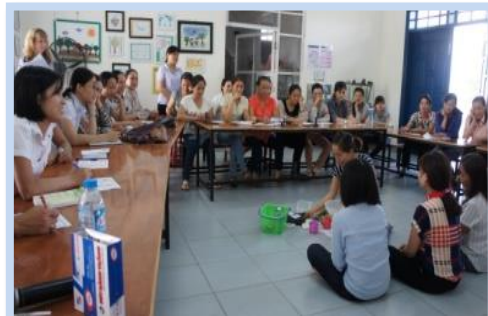
Staff role played during the workshop to demonstrate how they engage with students.