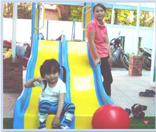
Student playing with the new slides.

The Office of Genetic Counselling and Disabled Children (OGCDC) under the roof of the Hue Medical College has been setting up projects for children with disabilities since 1999. The project of the Early Intervention (EI) in Hue City, in the Central area of Vietnam, emphasizes creating a professional environment for supporting families with children with disabilities as well as teacher training and colleague support. The Early Intervention centre provides a wide range of therapies including speech and physical therapy. Educational support is provided not only for children with disabilities in the Thua Thien Hue province but also for some nearby provinces. This centre is equipped with basic furniture and a limited resource of toys used for teaching and learning plus playing and having fun.