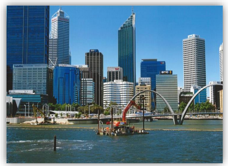
The Perth Convention and Exhibition Centre is the long low building on the left...amidst ongoing construction in the harbor area.

You might feel that 2017 is far in the distant future, but we have already begun the preparation for our next IASE Conference. The destination is Perth, Australia which is nestled on the western side of the continent. It's called the most isolated city on the earth, but Western Australia's capital is now basking in the glow of major investment, ambitious development, and some glossy high-profile buildings. One of these buildings is the beautiful Perth Convention and Exhibition Centre which will be the venue for the 15th Biennial Conference of the International Association of Special Education.