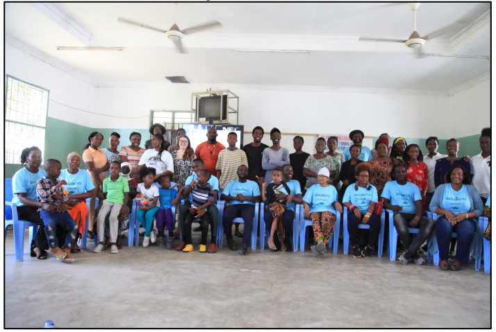
World Autism Awareness Month in Dar es Salaam

was among the guest speakers of this event. The education provided at the event arose awareness among people who believe that disability is like a disaster within society.