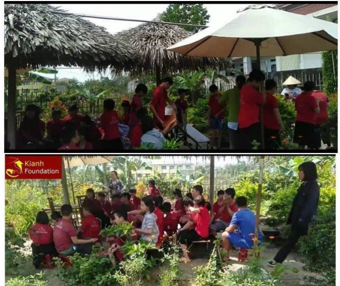
Children at Dien Ban Day Centre

IASE has been working with Dien Ban Day Centre since its opening in 2012. This centre is the first of its kind in the region and addresses a critical gap by providing much-needed special education and therapies such as physiotherapy and speech to children with disabilities.