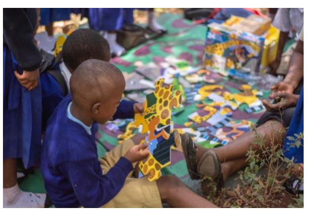
Kids are busy playing games donated by IASE

With the help of our tutors, whom we recruit and offer intensive training on how to deal with and support students with learning difficulties, the items donated are used by our kids to learn while they enjoy playing with them. Our schoolchildren are happy using these items, you can tell from the smile they put on their face while playing.