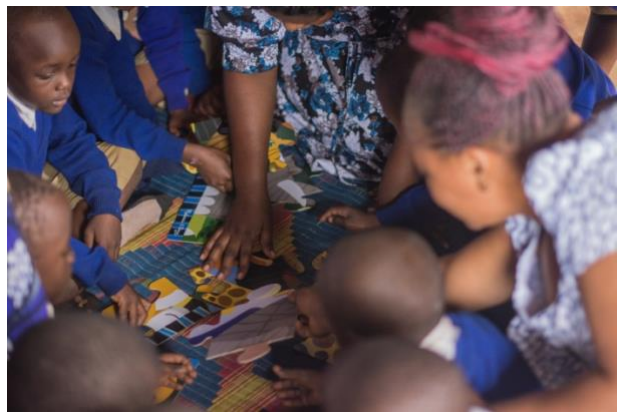
Kids getting instructions on what is supposed to be done from our tutors

Early this year our team in Tanzania received a shipment of learning games which were donated by the IASE to support kids with learning difficulties in public primary schools. The items donated were supposed to reach Tanzania in the middle of the year 2020 but because of the pandemic things slowed down a little bit.