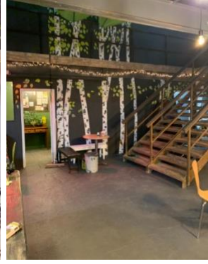
The Leadworks is a space with multiple purposes. It provides a space for grassroots community organisations, artists, and the whole community to come together. Various venues, such as art studios,