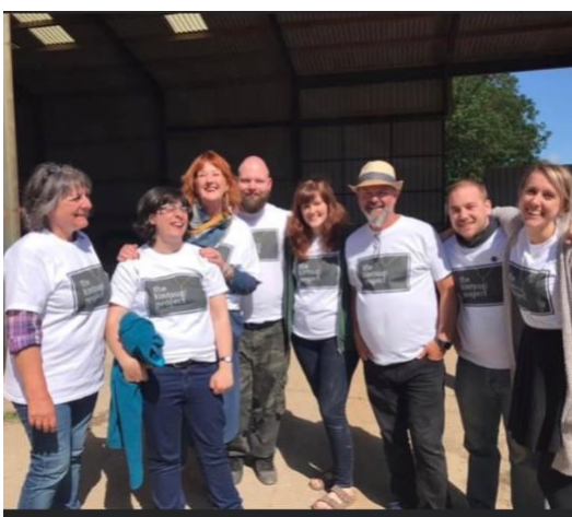
The Leadworks is another project focused on creating an inclusive environment and foster sense of belonging for the whole community.