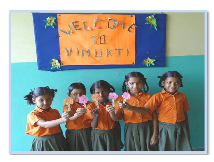
Vimukti girls happily showing off their popsicle flower.

And they all keep on dreaming and realizing it all when only a few years ago it seemed to be impossible. Congratulations to all of the actors who turn these dreams into reality. IASE has helped a bit over the years by being able to provide some school supplies, books, uniforms, and a local puppet show performance. So, all of you can share in their success! These well deserving students learn more than just the prescribed curriculum. They know that working together towards goals, by sharing and volunteering, dreams can become real!