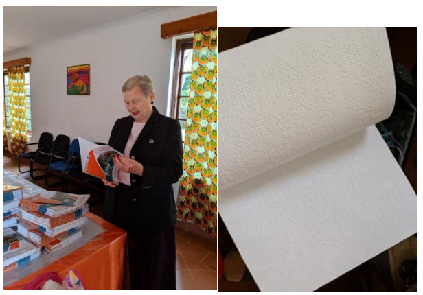
The Program Booklet was beautifully prepared by Vuga Press. Because we knew we had conference participants who are blind, the program booklet was also printed in braille.

resources may vary, our passion, drive, struggles, and gains unite us all. Networking took place, ideas were shared, opportunities to become involved in IASE were presented.