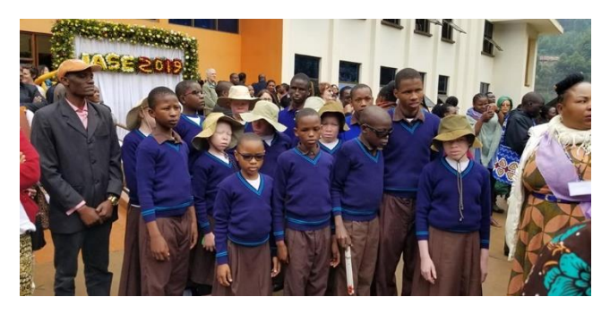
Students from the Irente School for the Blind provided greetings for conference attendees in front of a welcome sign made of local roses.

The struggles of providing quality special education were discussed and the world became a little bit smaller as we learned that while our locations and