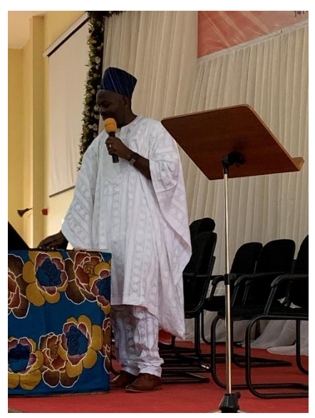
Keynote speaker from Uganda