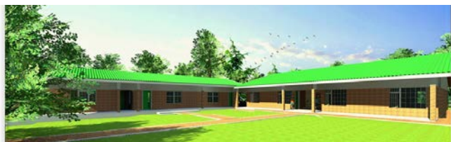
A picture of the planned Vocational Training Centre

Within the next few months we will begin a fundraising campaign to elicit support from the business community in Blantyre. The main activity will be a campaign called 'Just One' in which we ask businesses and community members to donate 'just one' item for the VCT, e.g. a door or window, a bag of cement, or a section of roofing. We will also be working with a pro-active youth organization willing to enlist youth to volunteer during the building or painting phase.