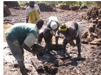
Making mud bricks Malawi style

Initial plans were drawn up pro-bono by a young Malawian architect and a surveying report prepared also pro-bono by a quantity surveyor also Malawian. We have made changes to the sizes and arrangement of the rooms. The picture in this article shows the two blocks of the VTC. A meeting held in January with board members, architects, and contractors planned the way forward for construction to begin as soon as the rainy season ends and the harvesting is completed.