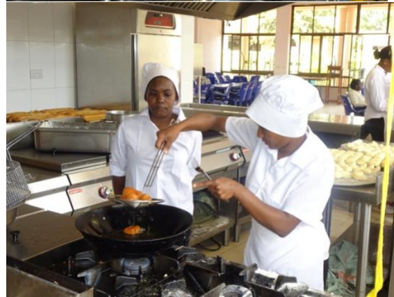
Young adults with cognitive challenges cooking pastries for breakfast