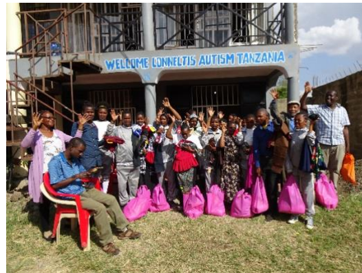
Group photo of the youth and their parents holding Christmas gifts.

Furthermore, the school held the graduation ceremony for young adults aged 18 years and older. Parents requested if CAT could include the graduates at the youth program or connect them to different stakeholders so the graduates can get further work experience.