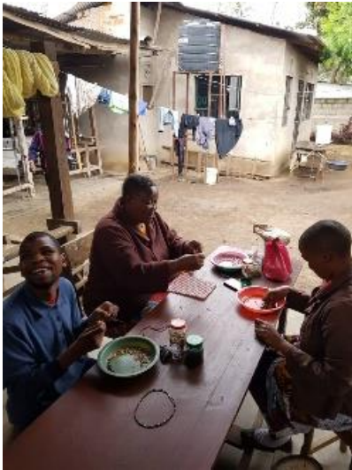
Young adults getting experience on different life skills activities

On December 18, 2020 CAT organized the parents and youth meeting at the center with the aim of sharing the achievements of young adults and to provide parents with work responsibilities to assign to the youth while at home. Following the meeting, CAT youth along with their parents celebrated their work and were given Christmas gifts to share with their family members.