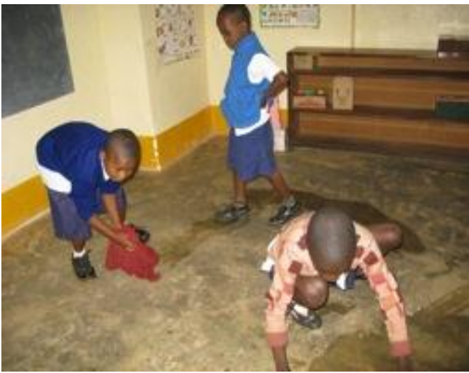
Figure 1. Boys in the Youngest Class Cleaning Their Classroom

through education of the students and the community is to dispel these misconceptions. A parent discussed the positive changes in her children's self-care skills since attending Rainbow: