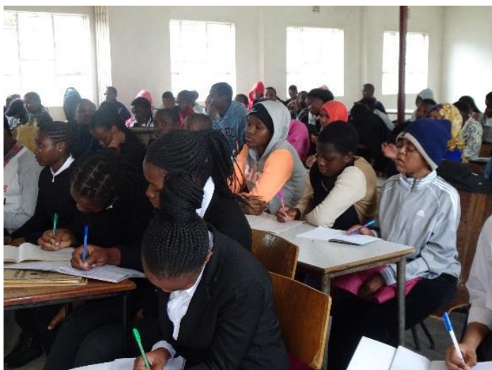
Zawadi (students with multiple disabilities) during class time

been a time of learning, innovating, experiencing, adjusting and finally consolidating and a stable platform had been constructed to continue and exceed the level of mentorship already achieved.