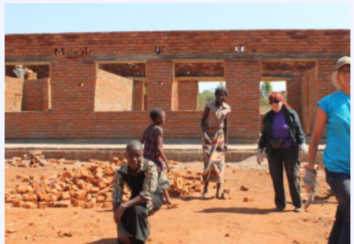
Building From the Ground Up

I could not even lift the buckets, and these strong women carried the water across a dirt road on their heads. Watching the school walls rise up from the ground was breath-taking.