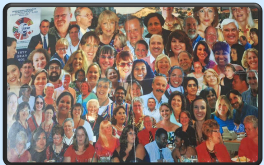
Memories from Alicante, Spain 2009

We look forward to hearing from you and enjoying our continuous success.