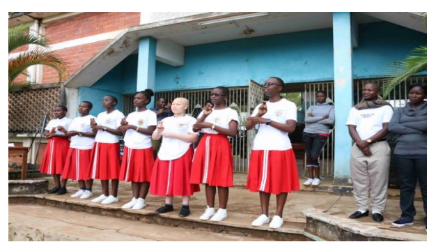
One of the outcomes of our Sign Language Club in the Rugambwa Girls Secondary School is having hearing impaired and non-deaf students join together to sign the national anthem.

For more information, you can visit the OSNET website <u>www.osnet.or.tz</u> or through our social networks <u>https://web.facebook.com/OSNETMUSOMA/</u> or <u>https://www.instagram.com/osnettz/ or</u> through my email dsmtech21@gmail.com